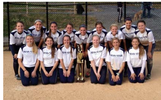
2012 State College Classic Champions Penn State University Club Softball poses with their trophy.

Day 2 kicked off the elimination games, where there was no shortage of skill or emotion in any game. Right off the bat the #7 seed Rutgers upset the #2 seed WVU! As the teams whittled down, the last two standing were #3 Ithaca and #1 Penn State.